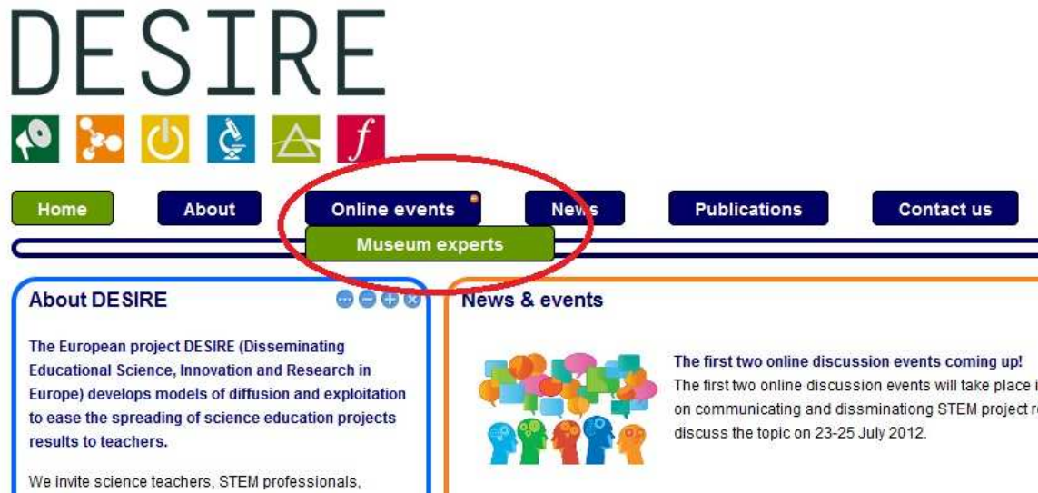
Figure 4: How to enter the online event

When the registration has taken place the participant can enter the open ODEs by clicking on the “Online event” button in the menu. Here the open ODEs appears directly in the menu: